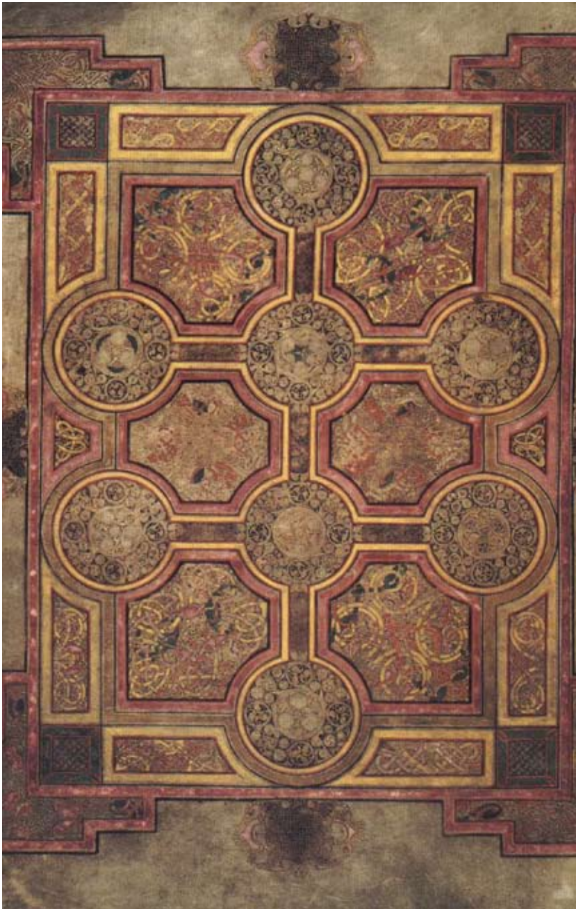
A Carpet Page from the Book of Kells.